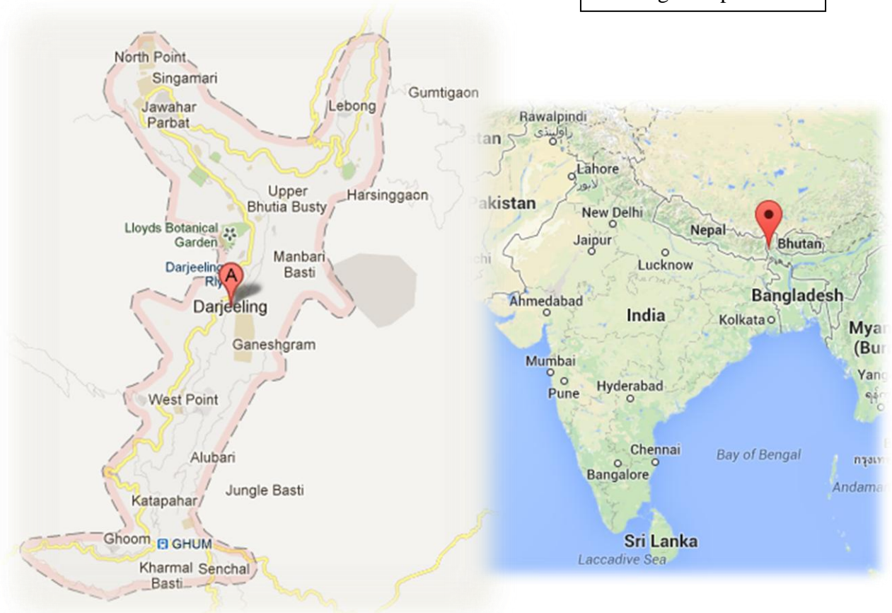
Darjeeling Town: All Photos taken by A. Connelly 2011