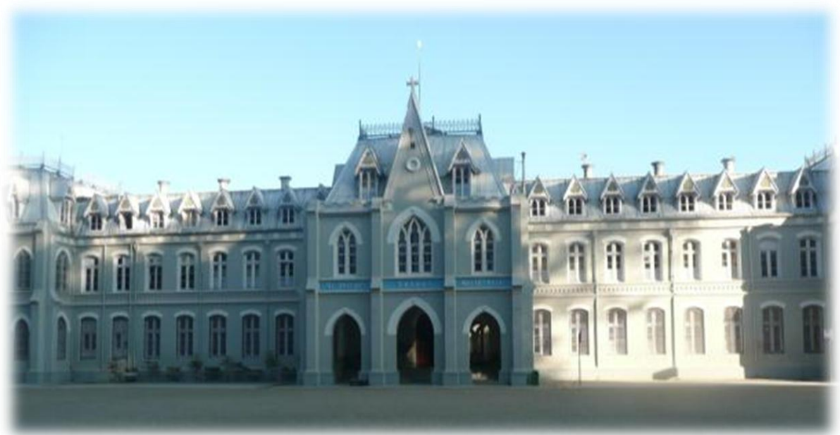
Above: North Point as seen from the main road. Below: The students gather for assembly in the quadrangle.