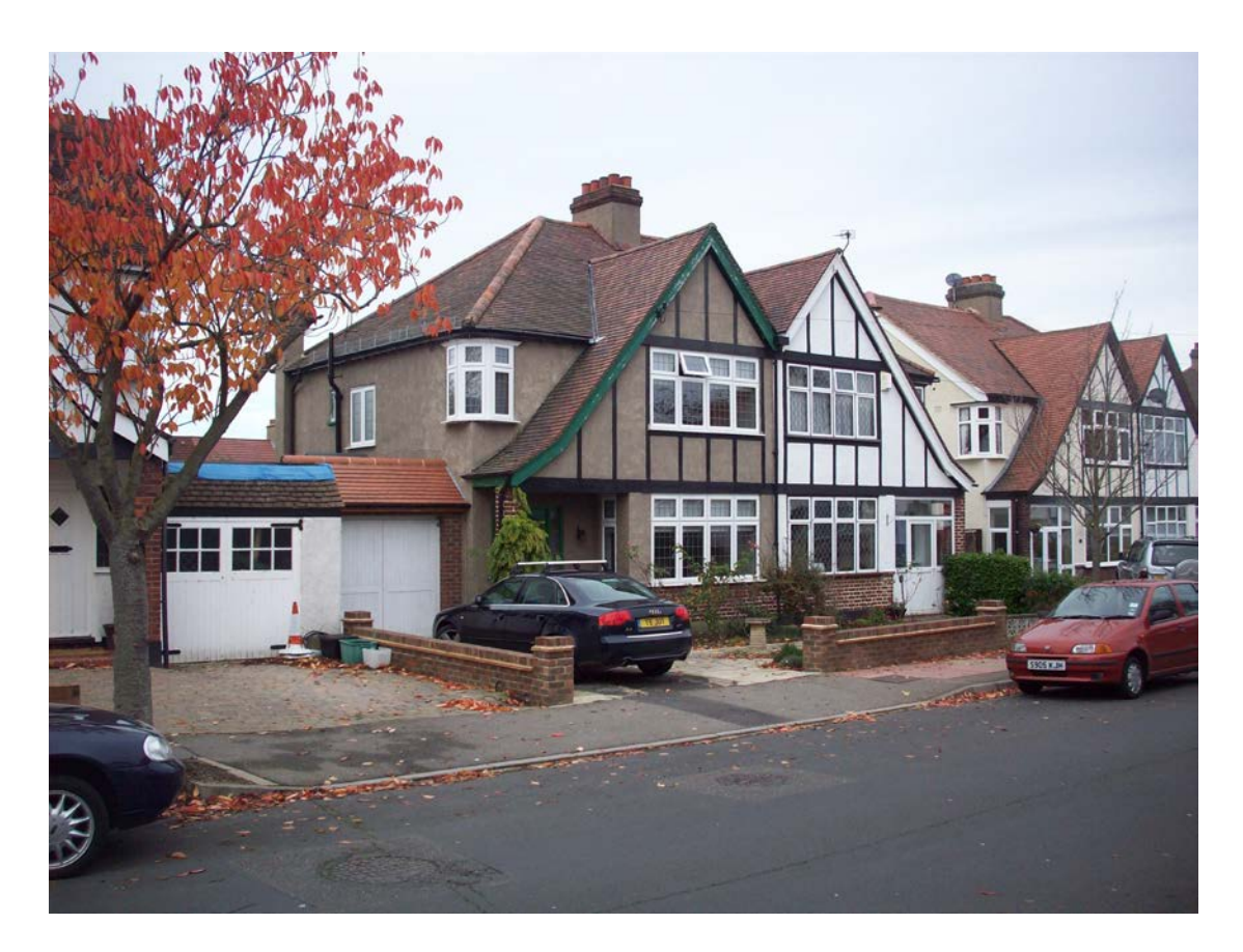
Fig. 2. The former 1940s House in 2008.

1940s House, Lyn found 'the time travel forward to her former life painful'.<sup>44</sup> As Gardiner notes, this return left her 'marooned in a complex space'.<sup>45</sup> To be more precise, the experience of re-enacting the wartime period revealed to the Hymers, and their audience, the deeper truth that contemporary Britishness is itself no more than a continual process of re-enactment and that once that re-enactment has ended, then there is nothing left but a lonely and alienating vacuum. The Hymers took one look about them and promptly headed straight back into the past by buying a 1949 Ford Prefect and maintaining many of their 1940s shopping and cooking habits.