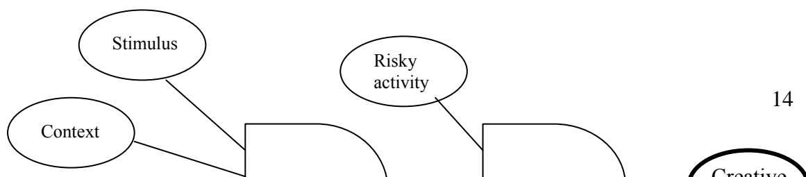
Figure 2: Small task to large task writing

It is then important to consider how students' writing experiences should be structured to enable them to develop as writers. This requires thoughtful construction of teaching at the level of small tasks, leading on to the emergence of work at the large task level (see Figure 2) through processes of mediated risk and creative gestation. Teachers need, as a priority, to allow time and space for students to develop as writers and need the confidence that creative writing is valuable in its own right. Beyond this, though not as its exclusive purpose, they can also be sure that such activities will enhance their literary studies. These outcomes require structured, individualised and appropriately varied teacherly intervention at the point of writing.