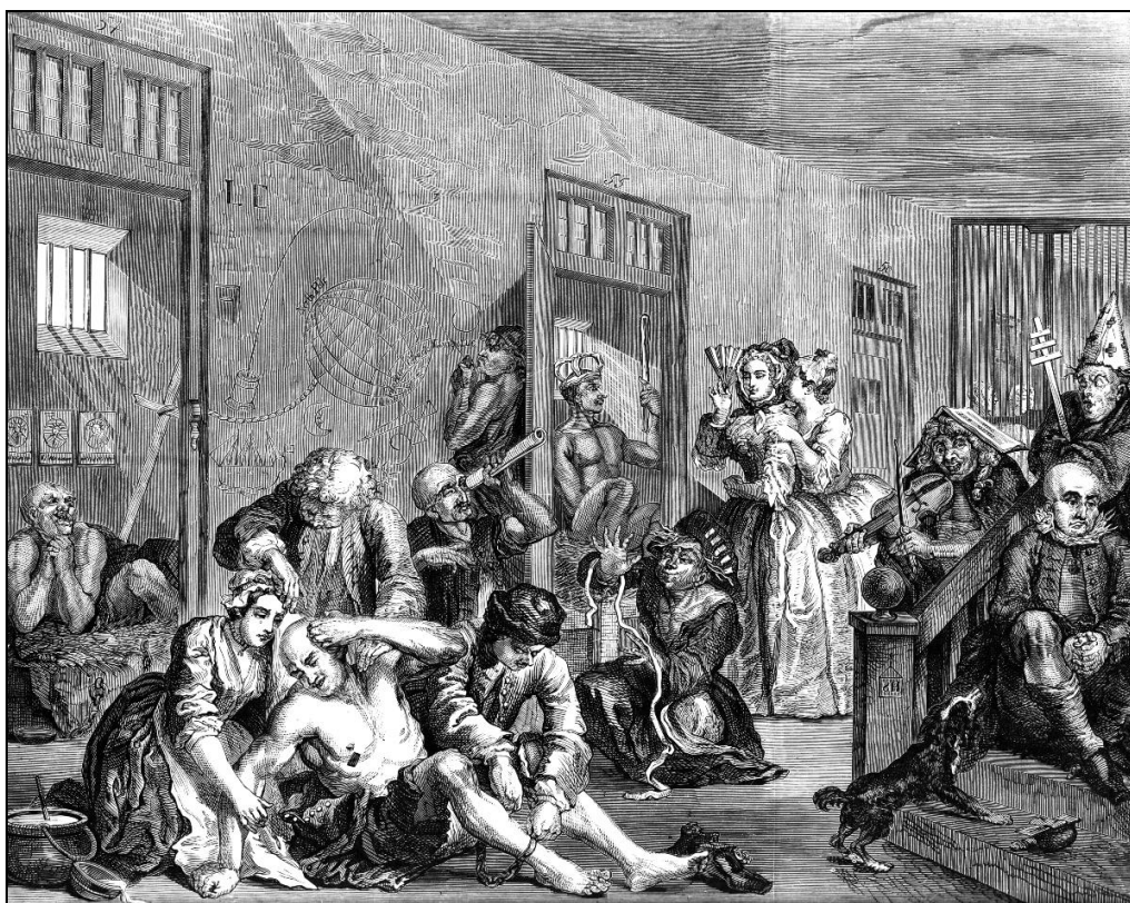
Figure 2: The Rake's Progress , Plate VIII "Scene in Bedlam" (William Hogarth)