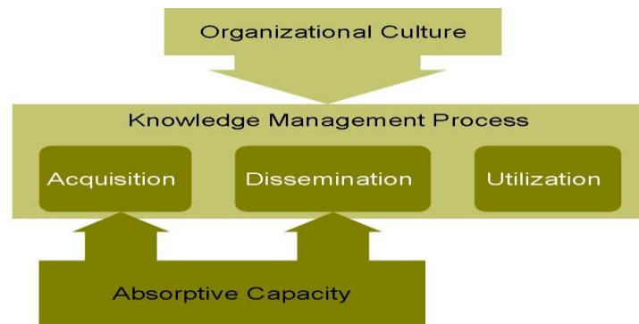
Figure 1: Theoretical Framework for KMP in Chinese SMEs

create and share knowledge within an organization (Holsapple and Joshi, 2001; Leonard, 1995).