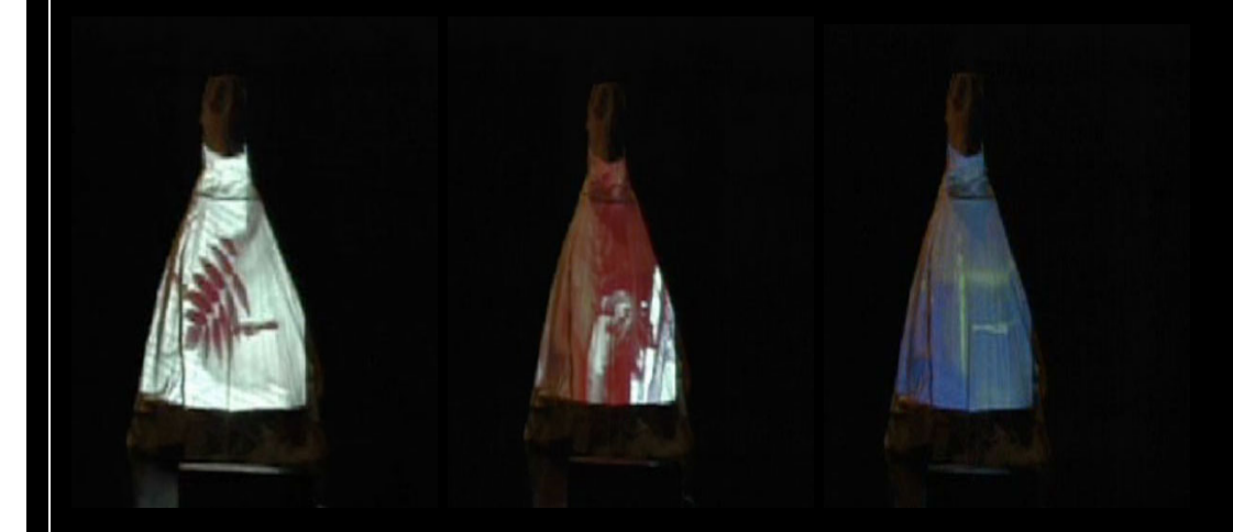
Helen Raleigh's film projections on fabric surface

The Arizona hoop, meanwhile, becomes a surface of filmic projection: leaves, twigs, branches of a forest flitter across it, its blue color changes slowly to green, brown, ochre. The use of understructures (in the garment), manipulated by the designer and examined by camera close-ups on our side, come to echo aspects of the Arizona dress. Elements of history (memory) held within the present (traditional technologies, hand embroideries, historically inspired cutting, and fabric with outline of previous shapes cut from it) inevitably hint at the future (organic garment pieces from which all ideas grow are cultured).