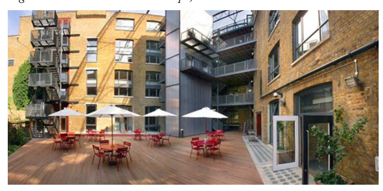
Figure 1. Clerkenwell Workshops, London.

ground level. However, some larger creative workspaces in former industrial/works buildings have survived this commercial gentrification effect, fuelled by more profitable advanced producer services in design and "creative" business services, which are able to pay higher rents (e.g. £35/sq foot). These form part of a geographically wider creative production chain and are made up of Florida's expansive creative professional class ("knowledge workers"), rather than artists/bohemians and crafts workers.