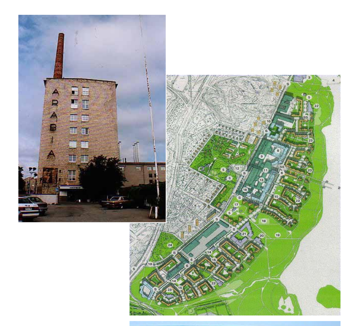
Figure 4. Arabianranta, "Helsinki Virtual Village"