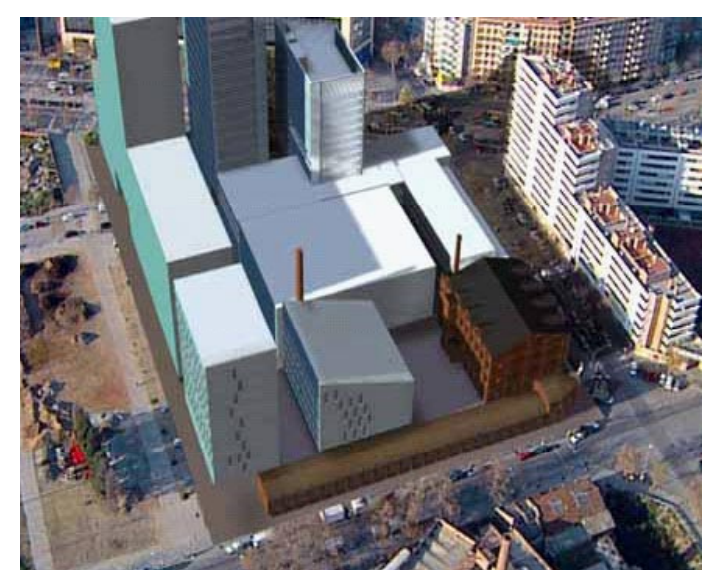
Figure 3. Poblenou, before and after @ Media, Barcelona.