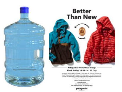
Figure 2. Refill water dispenser jar. Figure 3. Worn Wear program.

includes high-quality, long-lasting products that boast extended service lifetimes but are not necessarily designed with reusability as a goal (Fig. 3). Users in this group exchange products with one another, by themselves or through intermediaries (e.g. resale platforms). Both groups consider reprocessing as cleaning for immediate reuse.