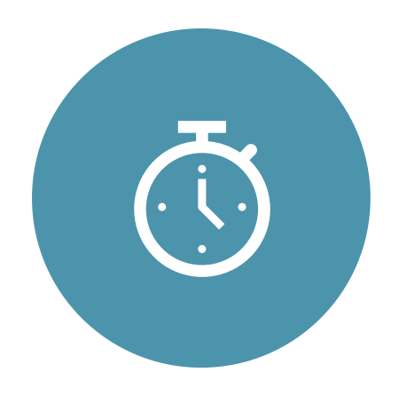
MAKING A CASE FOR CHANGE AND ACTION