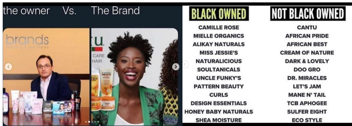
Figure 2: Instagram posts denouncing non-Black-owned companies