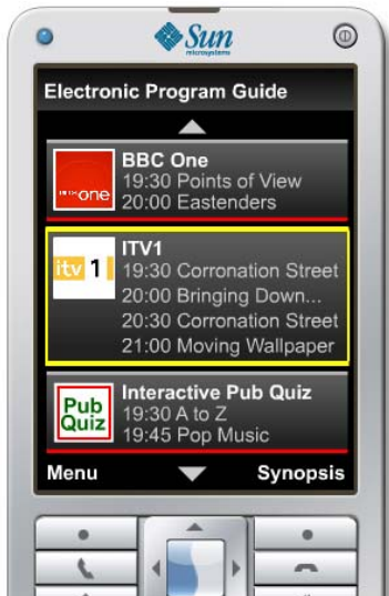
Figure 3: The Rich Media Mobile Browser in action showing the Electronic Service Guide listing available services to consume

Play-out of Mobile Interactive Services is a key part of the Rich Media Mobile Browser. The browser can render and provide interactivity based on the proposed SVGT-based Mobile Interactive Services format by parsing through the retrieved document and identifying user interface elements and performs their associated actions. For example, if the browser discovers a graphical element such as a <rect> (a rectangle graphic) has been specified to act as a button, it will obtain the button's required action through its action attribute. The action value will provide the details of what action to take should the button be clicked on or selected using the device's navigation keys or keypad. The tie-up between the user interface graphics and their actions for interactive services are created using the Rich Media Mobile Platform's Service Creation Tool, which is discussed in the next section.