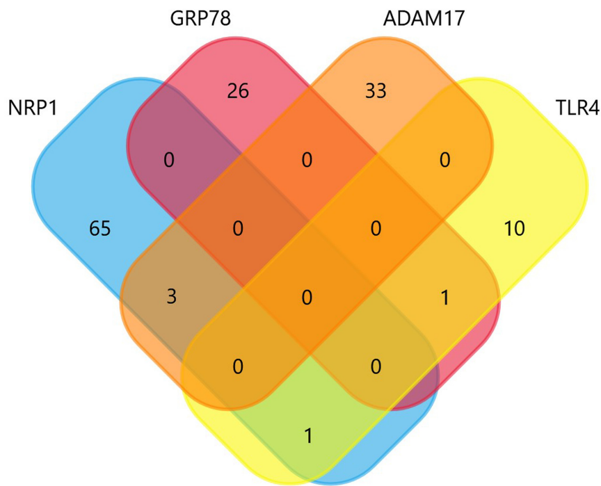
Figure 2. Venn diagram describing shared miRNAs between NRP1, GRP78, ADAM17 and TLR4. NRP1 and ADAM17 share three common miRNAs: hsa-miR-148a-3p, hsa-miR-152-3p and hsa-miR-148b-3p. TLR4 and NRP1 share one common miRNA, hsa-miR-587; whereas TLR4 and GRP78 share hsa-miR-338-5p as a common miRNA.

only one possible interaction identified between a miRNA and CD147 (BSG); Table VIII presents 12 interactions identified between miRNAs and TLR4; and finally, Table IX outlines five possible interactions of these regulatory RNAs with mGluR2.