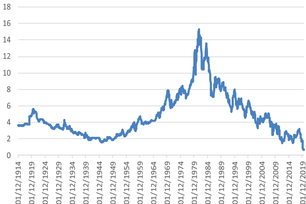
Figure 2. 10-Yr US Bond yield (average of monthly observations).

model, we follow the non-parametric approach of Bloomfield (1973) that has been shown to work well in the context of fractional integration (see Gil-Alana 2004c).