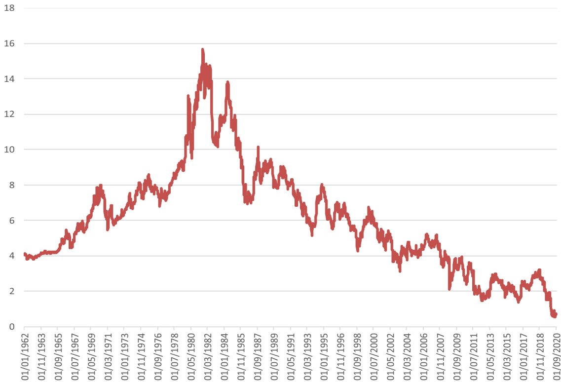
Figure 1. 10-year US Bond yield (.USGG10Y index).

where m indicates the degree of non-linearity. Thus, the higher m is, the less linear the approximated deterministic component is (see Hamming 1973 ; Smyth 1998 ). Bierens (1997) and Tomasevic, Tomasevic, and Stanivuk (2009) argue that it is possible to approximate highly non-linear trends with rather low degree polynomials. In this context, if m = 0 the specification contains only an intercept; if m = 1 a linear time trend is also included, and if m > 1 , non-linearities are allowed. When estimating the model given by (1) we set m = 3 , thus capturing non-linearities in the series if \theta_2 and/or \theta_3 are statistically significant. We also assume that the errors are autocorrelated to allow for some degree of weak dependence. However, instead of using a standard AutoRegressive Moving Average (ARMA)