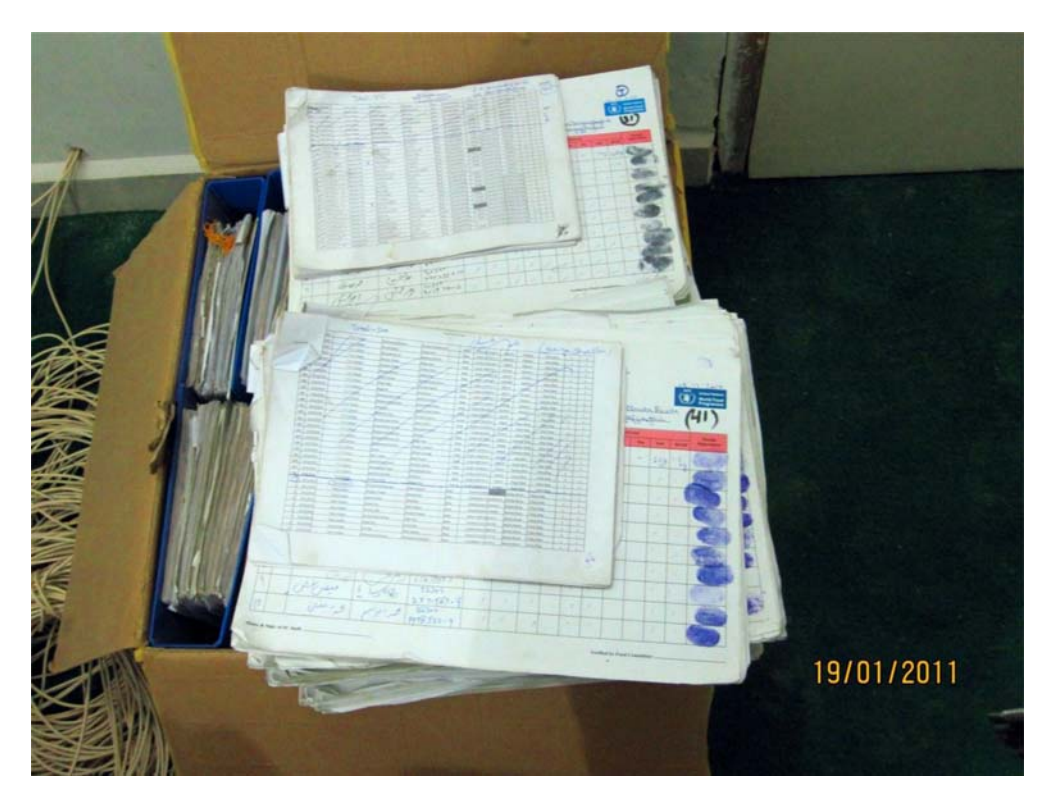
Selection lists maintained by an aid organisation. After the distribution of relief goods, each person on the list is required to sign (or deposit a thumbprint) confirming receipt of goods. Some recipients felt this was humiliating: "It is not that we are voting in the election, we are just getting a damn bag of rice and pulses!"<sup>1</sup>

Accountability as a set of short-term and rules-based behaviour, rather than a system of relations, ultimately undermines true organisational learning and can even hamper organisational survival. The following section takes these considerations further in light of a humanitarian accountability system instituted by an international organisation following the 2010 monsoon floods in Pakistan.