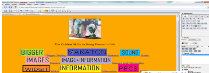
Fig. 1. STP user Interface