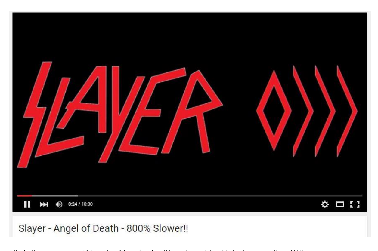
Fig I. Screen capture of Youtube video, showing Slayer logo with added reference to SunnO))).

This contrast is also used in online postings. A Youtube user posted a sound clip with a famous Slayer track drastically slowed down, together with an image that added the 'O)))' design associated with SunnO))), and by extension drone metal, to Slayer's jagged name logo ( Slayer – Angel of Death – 800% Slower!!! , 2010). Commenters referenced SunnO))) and drone metal, while also suggesting that it sounded like hell or the voice of Satan. Here, the radical differences in speed between SunnO))) and Slayer are noted, but at the same time a commonality in metal timbres is recognised.