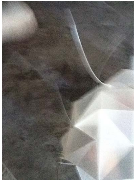
'Kepler', sound object, designed by Michèle Danjoux, DAP-Lab 2015