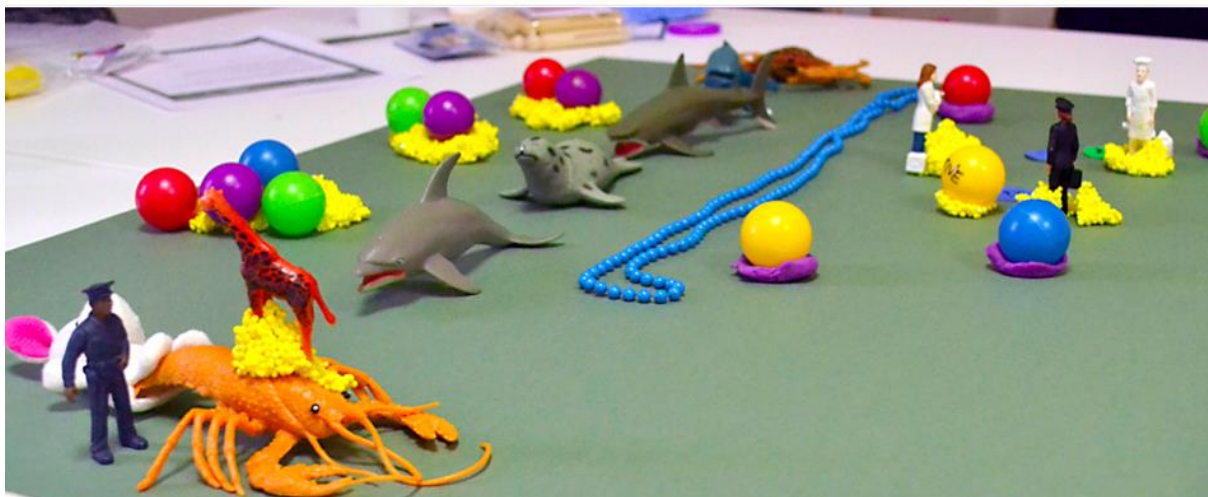
Figure 4 (top) Visualisation of BITNATION; Figure 5 (bottom) Visualisation of Trust Stamp.