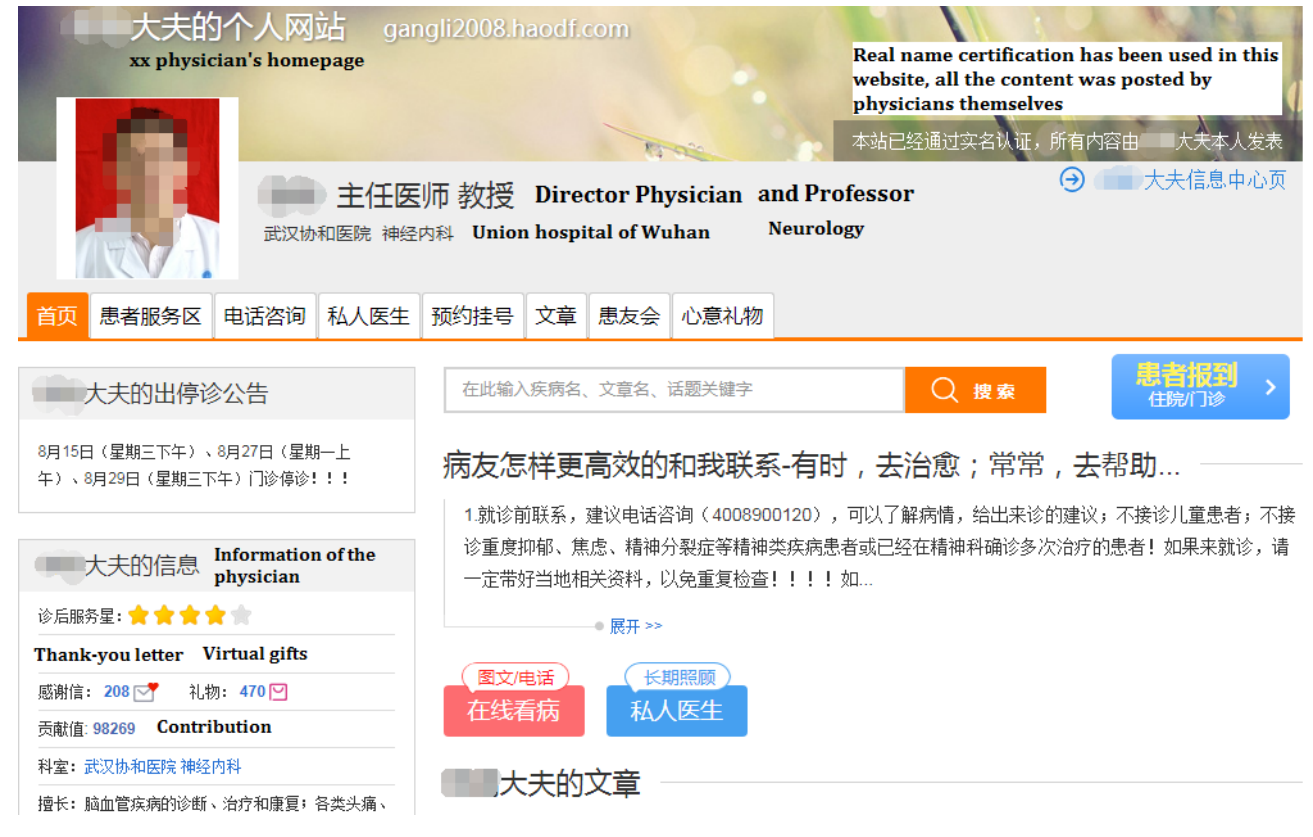
Figure 1. An example of a Physician's Homepage (Accessed on August 29, 2018).

The online homepages of physicians provide many types of information about physicians, including the total number of homepage views, number of votes, and number of thank-you