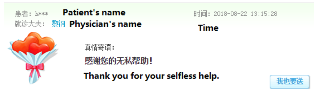
Figure 3. An example virtual gift.