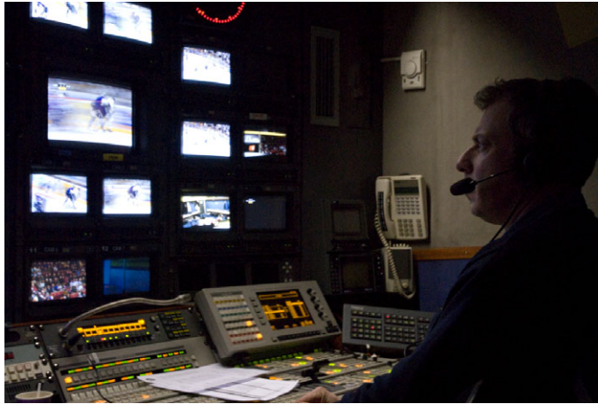
FIGURE 3. Vision Mixer and Production Gallery