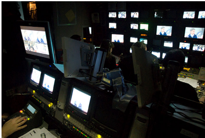
FIGURE 4. Replay Work Station Showing Monitors and the XT[2] Control Unit

commentators over a microphone by pressing a button to activate the intercom system.