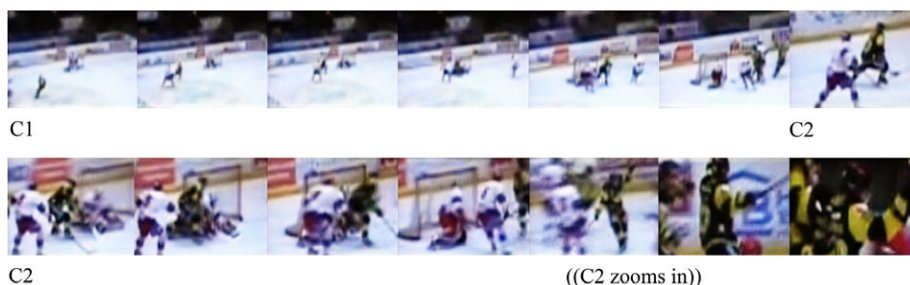
FIGURE 7. Screenshots Showing EVS Sequence from Lines 19 to 30 in Extracts 1a-1b (Timeline Flowing from Left to Right, Top to Bottom)

prior to the goal, implying that this is the reason for such poor game play (line 21). Having finished viewing the first replay of the goal (segment finishes in line 22), the commentators address the issue of the “save-ability” of this goal in their commentary (line 22 and onwards). After the EVS operator’s announcement that the replay footage is due to finish (line 26), the VM announces and carries out a cut to camera 2 for broadcast (lines 29–31), as the commentators continue to complement the attacking player’s skillfulness (line 32). Although it might be argued that the skilled reading of the game by the producer, VM and commentators could have led them to focus on exactly the same question (and use the same term) on the reason for this goal, a more plausible explanation is that they use the instant replay and audio link as resources for them to mutually orient towards the same topics. What we see then is that the EVS operator, VM, and commentators reflexively provide resources (questions, relevant EVS footage, and interpretive commentary) to the others on this topic as it develops, so that they can themselves in turn provide additional resources to interrogate this explanation.