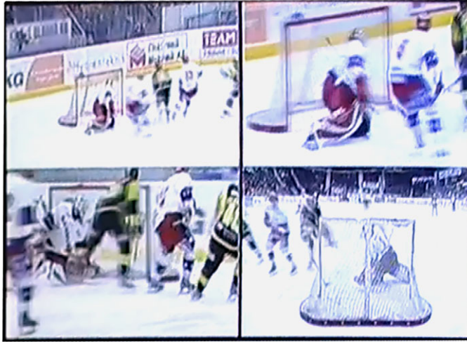
FIGURE 6. EVS Operator's Screen Displaying a Split of Four Selected Cameras

situation (see Figure 6, showing the view from four cameras, immediately following a goal).