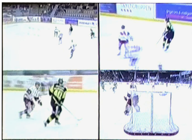
FIGURE 2. Typical Shots Provided by the Main Cameras Covering the Same Action; Overview by C1 (Top Left), Close-Up from the Same Angle by C2 (Top Right), Low Close-Up (C3) and Fixed View behind Goal (C4). Captured from the EVS Workstation

arena had workstations for the VM, producer, production assistant, and graphics operator, all facing a video gallery (Figure 3). This video gallery displayed all of the camera feeds on wall-mounted monitors, the replay operator's work and graphics overlays. Directly behind the VM was the replay (EVS) operator's workstation. Because of their physical proximity, the VM and the replay operator can talk to each other directly. Everyone in the OB studio could hear the commentators over the loudspeakers inside the studio. The VM could speak directly to the commentators via an intercom headset, while the replay operator could speak back to the