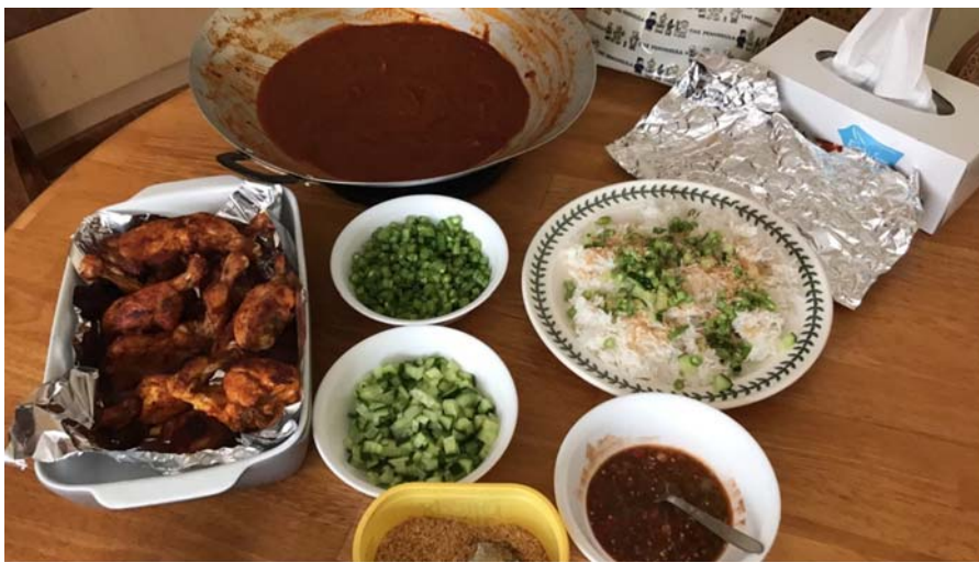
Plate A1. Farid's diner table – fried chicken for Farid is kept with rice and spicy curry