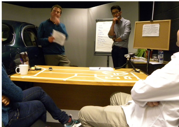
Figure 2. Venue for the workshops, during a focus group session.

The venue selected was a large research laboratory (Figure 2) which hosts a parked test automobile (2002 Jaguar S-type; Figure 3). This was to keep the workshop's exercises psychologically grounded in automobiles and driving while minimizing effects of scenery, weather, or temperature. Tables were arranged with the various automobile controls (Figure 4).