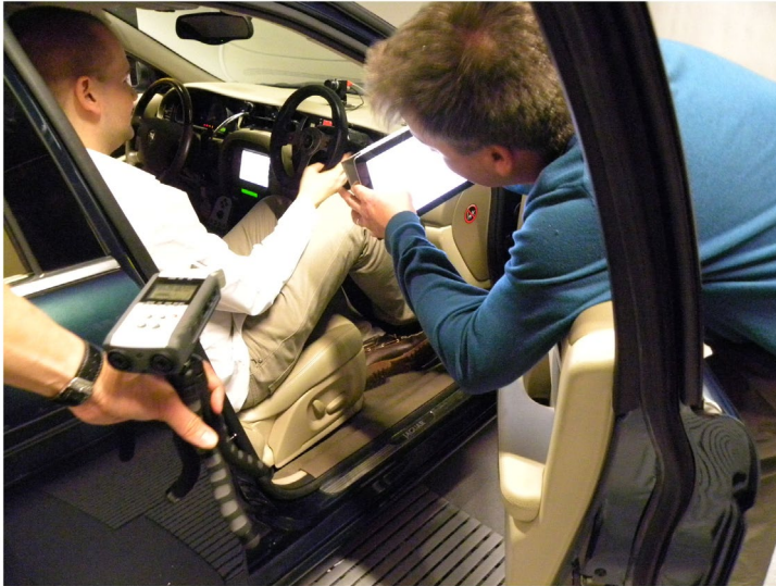
Figure 3. A test car parked inside the workshop being used to keep the sessions 'grounded' in automobiles.