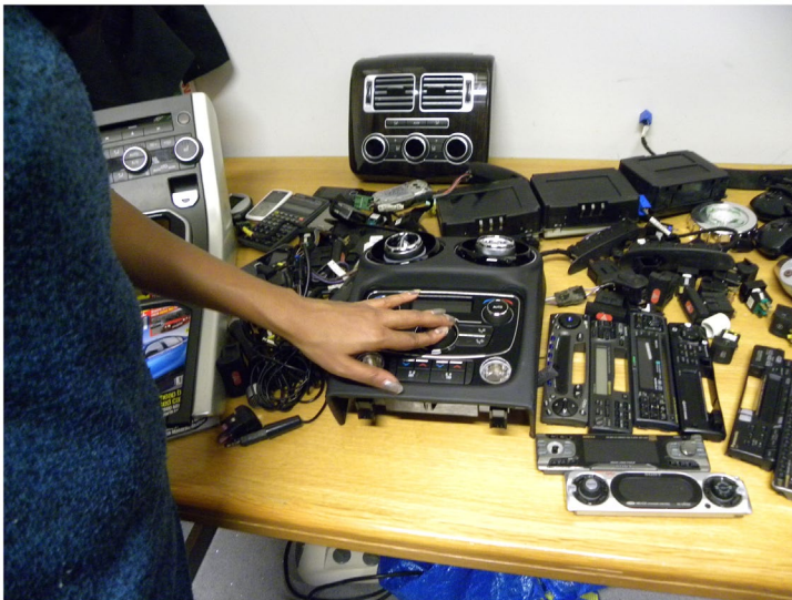
Figure 4. Tabletop containing some of the automobile components for use in various workshop sessions.