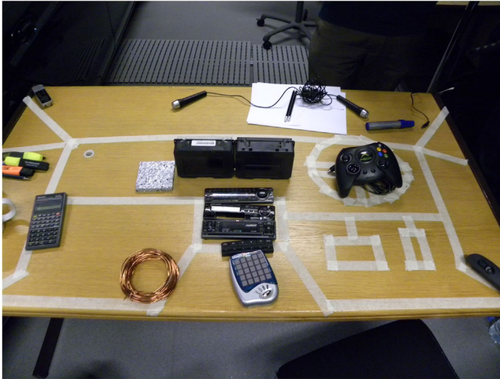
Figure 9. An example 'unnatural feeling dashboard' creation, exhibiting many small identical buttons, rough and metallic textures, and sources of visual distraction.