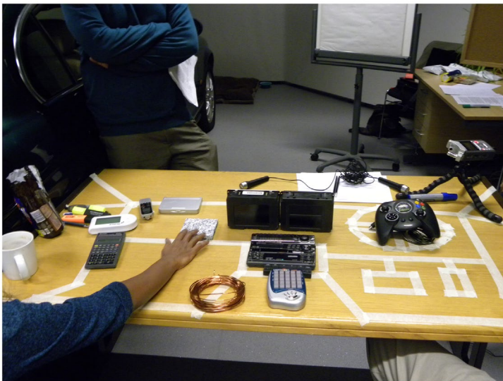
Figure 10. Participant explaining features of a dashboard creation in the flexible modelling session.

that a natural-feeling automobile should not be too comfortable. Comfort is generally not considered significant in naturalness by the wider literature. It may be that participants' basic human need for comfort and privacy was misinterpreted as a naturalness requirement.