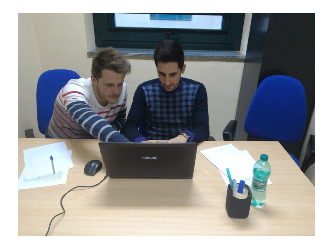
Figure 2: A pair of professional developers

The study was conducted by a single observer (the first author of this paper) between May and July 2015, and was founded on one-to-one sessions between the observer and each pair. The use of one-to-one sessions is almost customary in ethnographically-informed studies (e.g., [31]). We conducted our study in Italian to minimize any bias arising from participants' varying levels of familiarity with the