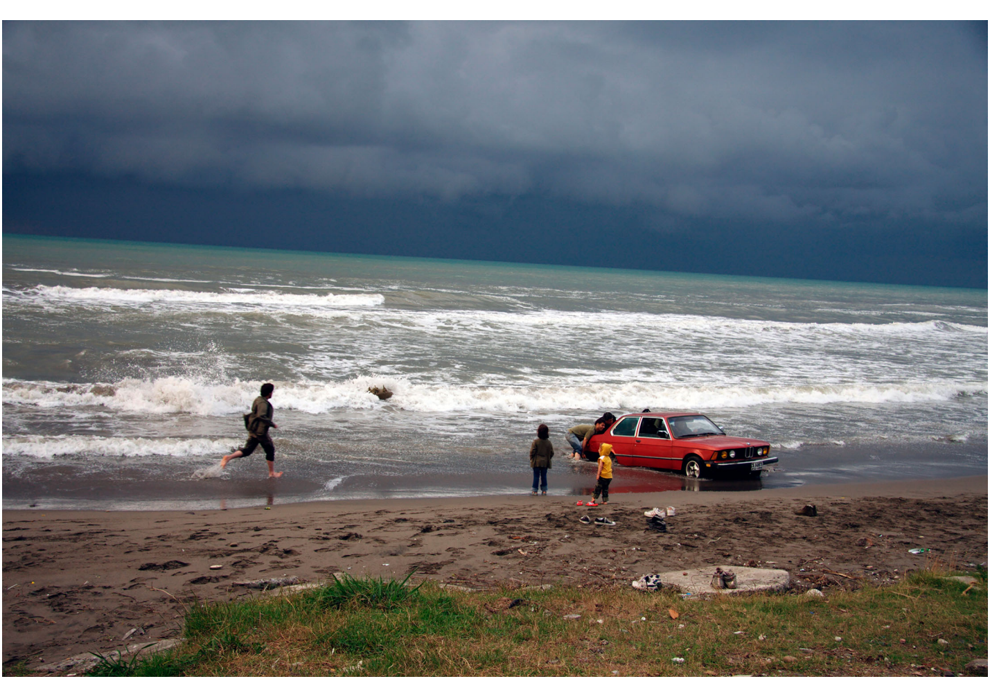
About Elly, Director: Asghar Farhadi (2009), still courtesy: Axiom Films

moral conundrums and questions of individual responsibility, but also clashing values and class conflicts.