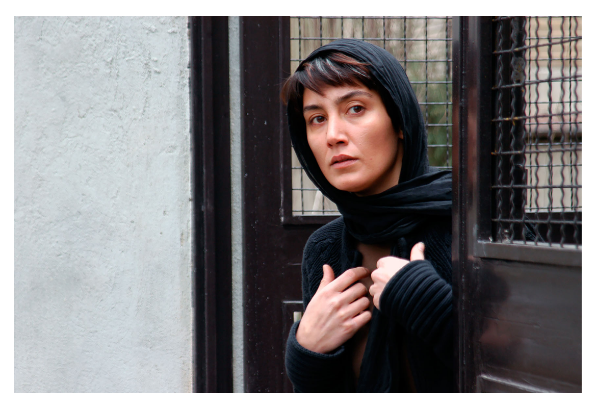
Fireworks Wednesday, Director: Asghar Farhadi (2006)

Having reviewed some of the resonances between Farhadi's insistence on questions of marriage, morality, acknowledgment and classical Hollywood cinema as analysed by Cavell, it is important, before accepting this proximity, to push the analysis of its significance a step further, to understand what else could be gained from a Cavellian framework.