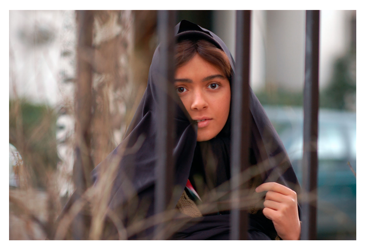
Fireworks Wednesday, Director: Asghar Farhadi (2006)