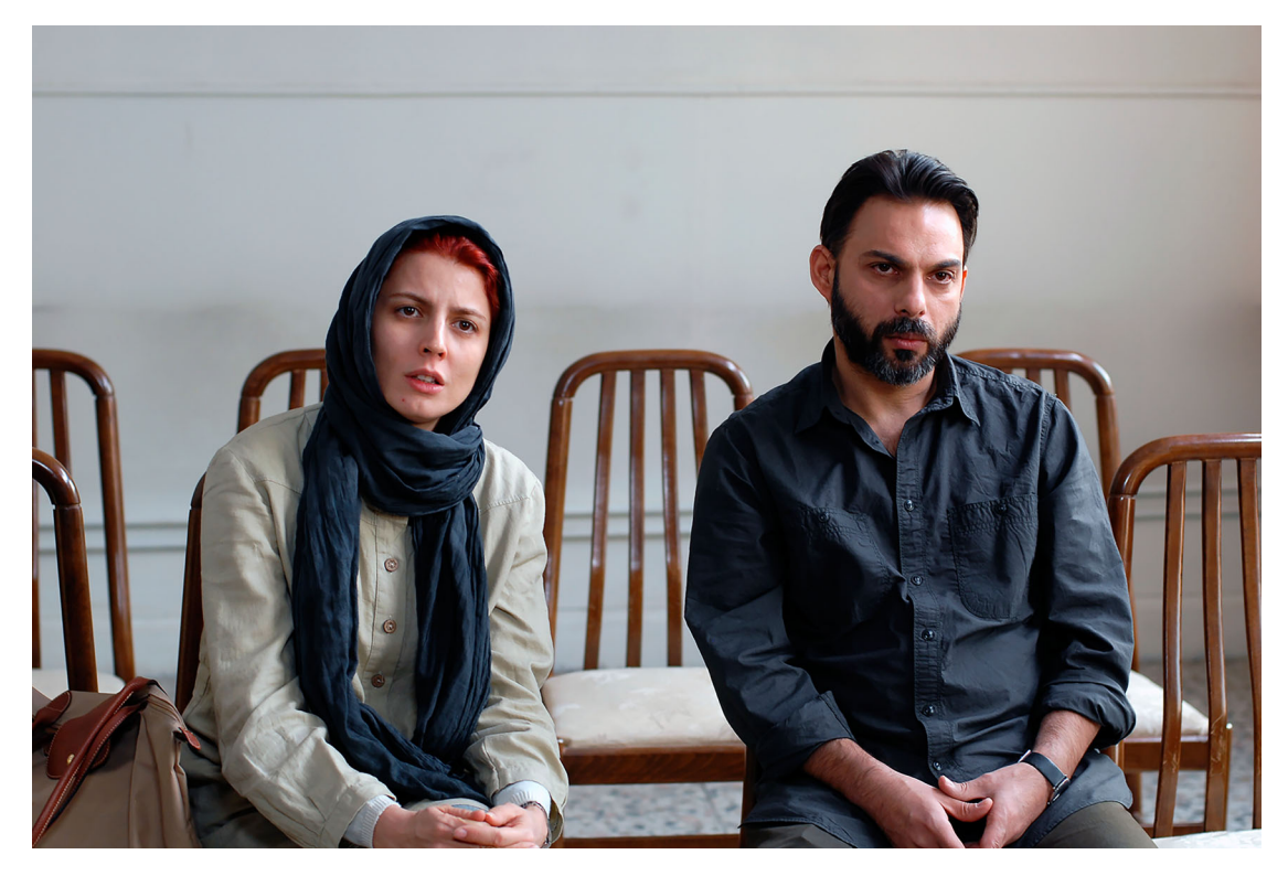
A Separation, Director: Asghar Farhadi (2011)