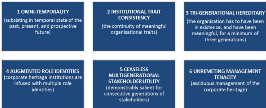
Figure 1. Balmer's (2013) Corporate heritage identity criteria

Phase 1 of the study encompassed: examining data on TRT in the public domain; undertaking four focus group interviews (subsequently translated into English from