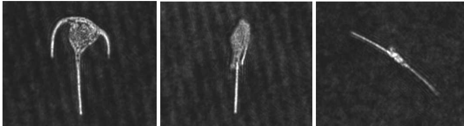
Figure 3: Reconstructed in-line holograms: Ceratium Tripos (left and centre) and Thalassiosira sp. (right). All same scale - image height approx 310 \mu m.

The classification system has been implemented as a three-layer neural network (seven input neurons, seven hidden neurons and five output neurons). The inputs are the size of the object and a simple measure of its elongation (the ratio of its diameters along the primary and secondary inertia axes), and some scaling- and rotation-invariant descriptors of shape (the first five Hu moments). The outputs depend on the image set used to train the network: e.g. for in-line holograms the network currently differentiates between Zooplankton; Floc (inorganic or dead matter) and three types of phytoplankton ( Asterionella formosa , Ceratium tripos and Thalassiosira sp. ) of which holograms of cultured samples were available. The viability of this approach was confirmed in tests, in which zooplankton and floc were identified 100% of the time and Asterionella , Ceratium and Thalassiosira were correctly classified 95%, 94 % and 85% of the time, respectively. The performance of the network (and possibly the range of output classes) will be improved when more images become available once the holocamera has been deployed.