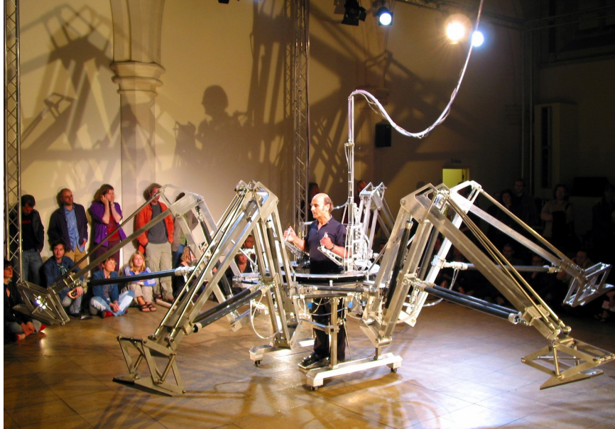
Fig 2: MUSCLE MACHINE, Gallery 291, London, 2003. STELARC

Additionally, artificial intelligence is featured in technological performance practices, where the challenge is to demarcate the delimited human body from an artificially intelligent life form, such as, Jeremiah the avatar in Blue Bloodshot Flowers 28 who was developed from surveillance technology. In the performance, his vast spectral face focuses on and tracks the movement of these like some deity, the figures he perceives being literally sub specie aeternitatis ('under the gaze of eternity').