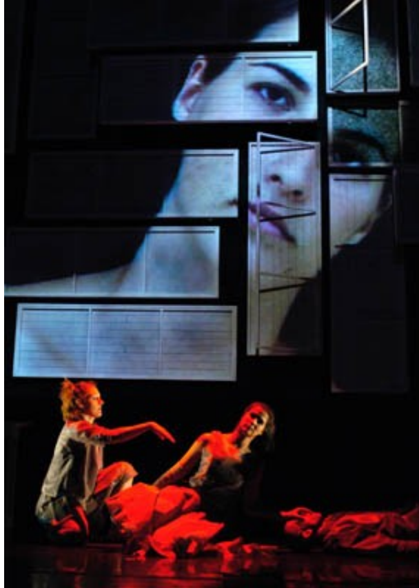
Fig 5: The Company in Future of Memory , 2003.

The retina of the eye is not linked to the whole of the cerebral cortex but instead to a fairly localized area now generally known as the ‘primary visual cortex’ or area ‘V1’. 38 Adjacent areas of the retina connect with V1, recreating a visual map of the retina on the cortex. Connections between the retina and the primary visual cortex are genetically determined, the necessary visual apparatus being present at birth. However, to be able to function at all this system needs to be exposed to the visual world. For whatever reason, if cells in the visual brain are deprived of this crucial exposure in the early period of life they become dysfunctional and are unable to fully respond to visual stimuli, if they can respond at all.