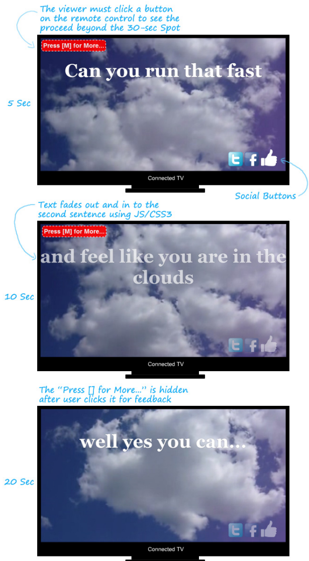
Figure 1. The “30-sec Spot” in HTML5

Overall, the system runs smoothly on all the test devices. It worked at its best on the Chrome HTPC since this browser has probably the most HTML5 features up to date and also provides excellent performance. Nintendo Wii, was the device with the most unsupported features, and actually one of the main reasons that it was chosen for this experiment: to test the