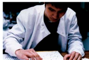
Figure 1. Image of student cutting and pasting chromosomes.