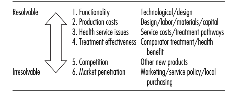
Table 2. Uncertainties in the Development Cycle

optimistic estimates in an early-stage deterministic headroom analysis (8). It is important to emphasize that optimistic estimates are a substitute for the probabilistic approaches considered here, which should be based on the best estimates available.