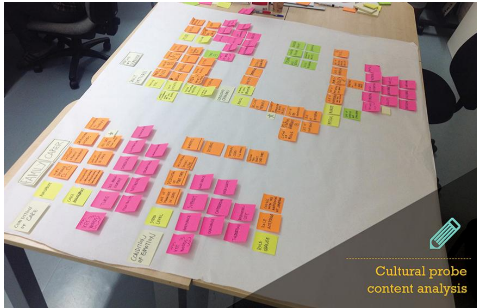
Figure 2: Process of cultural probe content analysis

To test these hypotheses, four main categories were set: two categories focussing on the family carers experiences; and the condition of care and emotion. On the other hand, two categories observed the effects of dementia on patients' daily life. They include observations of daily patterns and condition changes due to dementia. It is important to notice, that the probe packs have been filled in by family carers and therefore represent their perspective.