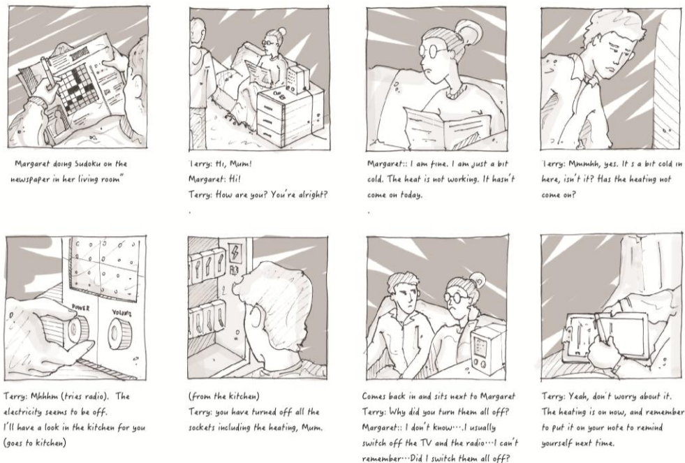
Figure 5: An example of design narratives storyboard