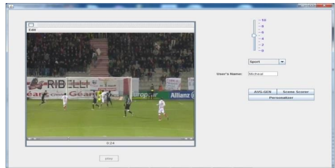
Fig.1. Interface for video experts to score the video frames

This phase is responsible for capturing an end-user's priorities in a particular video. As a result, prior to the generation of any final summary, end users will be provided with some visual and textual information regarding the content of the existing video scenes.