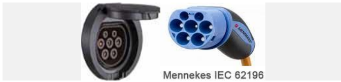
Fig. 2. Mennekes socket and one end of the charging cable