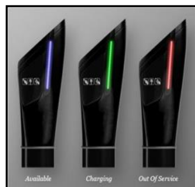
Fig. 1. Pod Point’s highly visible status lights

The blue, green and red highly visible status lights present along the side of the Pod Point will allow the EV drivers to understand from distance whether the unit is available for use, already in use (vehicle is being charged) or out of service. In addition to this the live availability map on Pod Point website will help to know the status of the nearest Pod Point. Live availability map can be accessed with this web link: http://www.pod-point.com/live-availability [2]