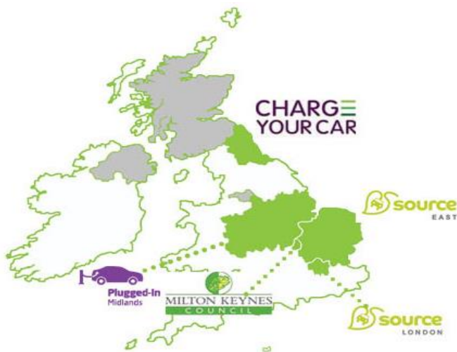
Fig.3: EV public charging networks in UK

“The Pod Point PAYG Network is Europe’s first pay as you go electric vehicle charging network. It allows anyone with a mobile phone to access charging points across the UK. There is no membership fee – anyone can use the charge points.