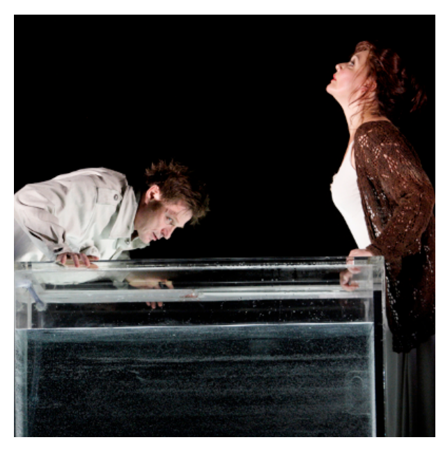
Wozzeck, Act 3, Scene 2. Royal Opera House production, 2013.

Den Himmel gäb' ich drum und die Seligkeit, wenn ich Dich noch oft so küssen dürft! Aber ich darf nicht! Was zitterst? (Berg, Wozzeck , III.2)