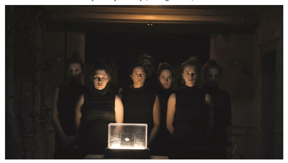
The chorus of women in Alles Weitere kennen Sie aus dem Kino, directed by Katie Mitchell, Schauspielhaus Hamburg, 2013.