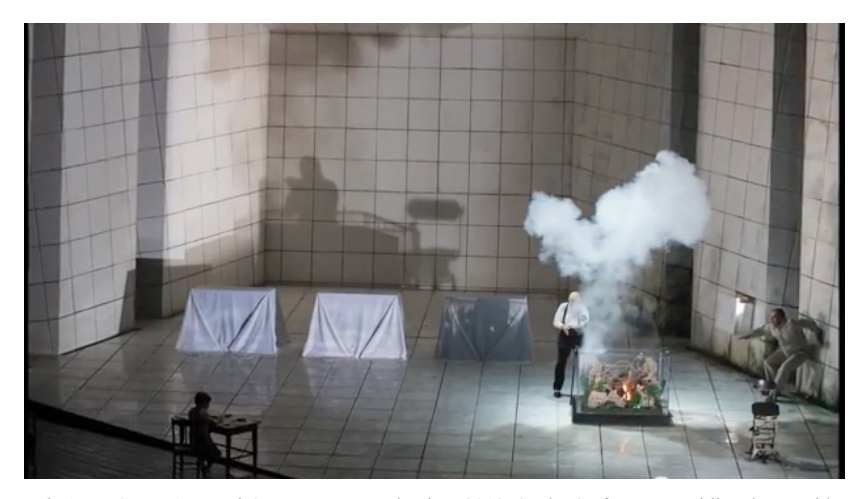
Wozzeck, Act I, Scene 1, Royal Opera House production, 2013. Set by Stefanos Lazaridis. Photo: Videostill.

tanks, initially covered with cloth to hide their contents. They are filled with water or formaldehyde, ready to receive scientific specimens; strange things float in some of them just as Damien Hirst once submerged a rotting shark – titled The Physical Impossibility of Death in the Mind of Someone Living (1991) – in a glass container, its gaping mouth open to our forensic imagination.