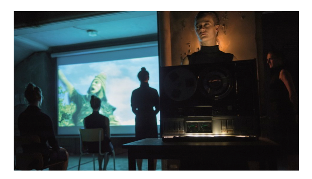
A scene from Alles Weitere kennen Sie aus dem Kino, directed by Katie Mitchell, Schauspielhaus Hamburg, 2013.

their deeds. Sometimes whole scenes of this imaginary war tribunal or chamber for a Truth and Reconciliation Commission rewind and are played backwards – whilst forensic evidence of their crimes is brought on and a few scarce video projections, in the corner of the room or under the staircase, accompany the confessions of the prisoners.