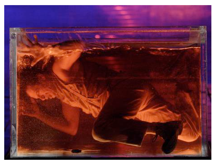
The drowned Wozzeck, Act 3, Scene 4. Royal Opera House production, 2013.

Warner seeks to achieve the visual, architectural symmetry of his psychoanalytic reading of Wozzeck by letting the young boy begin and end the performance. There is no hobby horse, and the shouts of the other children's taunts are rendered as whispered voices (from surround loudspeakers) that gradually mingle with Berg's concluding dissonant, 'quavering' music, stretching 'the very limits' of D Minor. The boy walks up to the water tank and looks at the floating Wozzeck for a long time, as if facing a strange apparition, then turns and looks at the