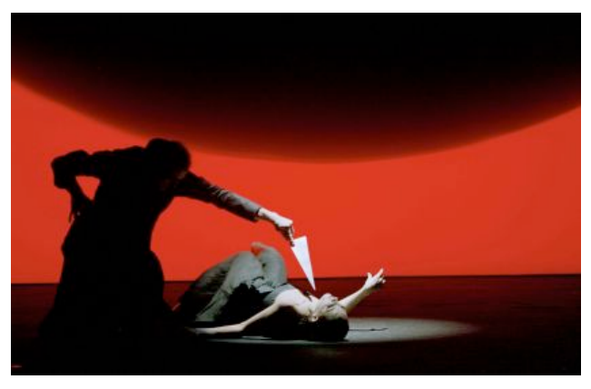
The killing scene in Wilson's Woyzeck at Betty Nansen Teatret, 2000.

counterpoints between visual and aural score; the choreography of the actors' movement is so stylized (and often slowed down) that we become aware of the formal parallelism (or juxtaposition) of the gestural and the musical structures. Wilson, one might argue, constructs a spatial score that gives more room for sound (and gestural vocabulary) to expand.